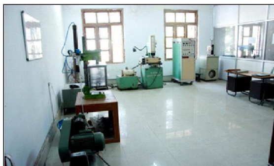
Non-Conventional Machining Lab.