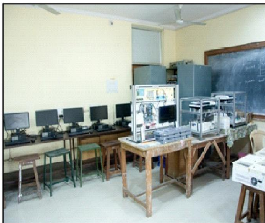
Computer Hardware Lab.