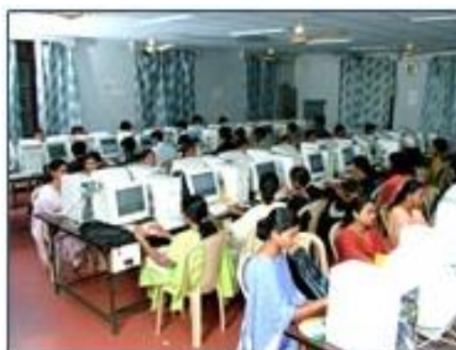
Linux Lab, MCA