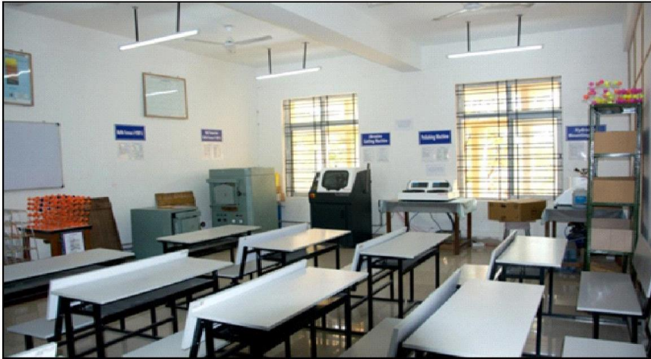
Physical Metallurgy Lab.

B.Tech. in Metallurgy & Materials Engineering