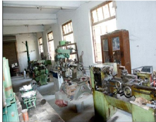
Production Engg. Lab.