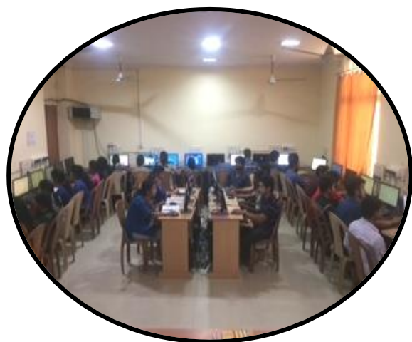
Computing Laboratory – II