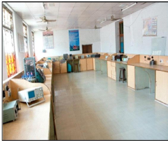
Electrical Machines Lab. Power Electronics Lab.