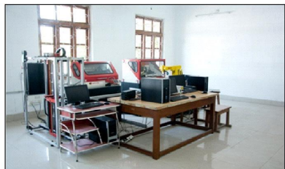
Robotics & FMS Lab.