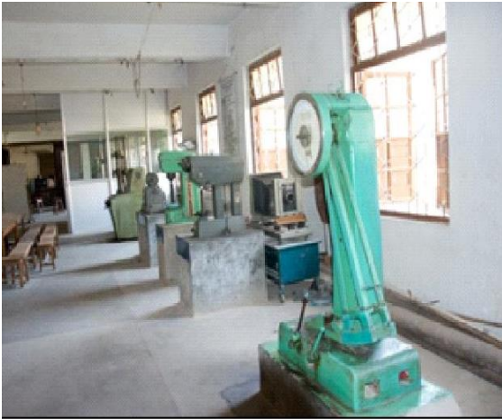
Materials Testing Lab.