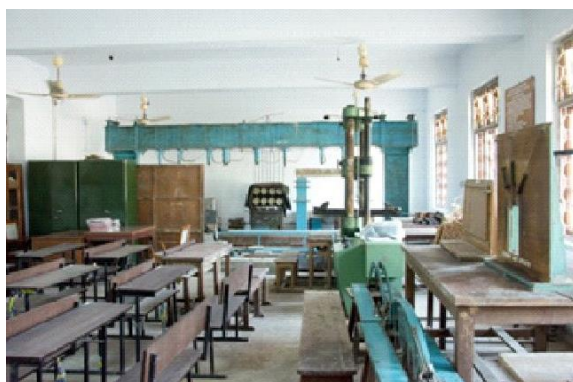
Structural Engg. Lab.